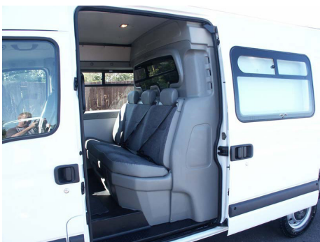
Three-seat rear conversion, trimmed roof lining, fully trimmed rear