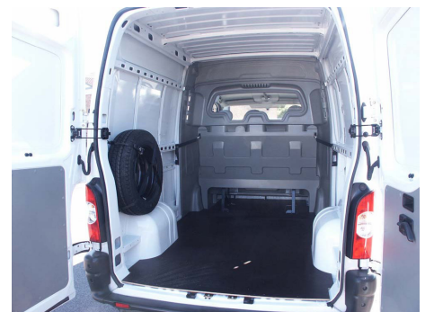
Rear Load Area Lining Option